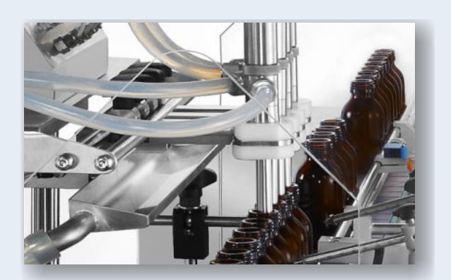
Shut-Off Nozzles and drip Tray Shut-off nozzles are strongly recommend for liquid with low viscosity.

The dedicated bottle holders are required when bottle mouth opening is too small to be centered and aligned with fill nozzles.