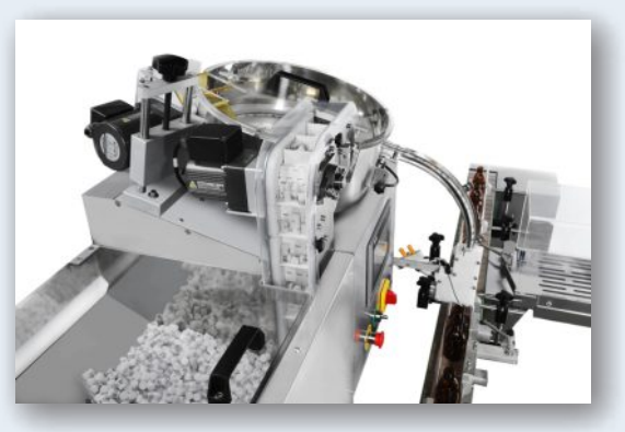
INTEGRATED PRODUCT HOPPER